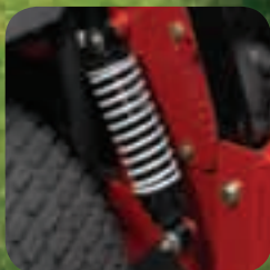
Suspension allows you to mow faster with a consistent cut.