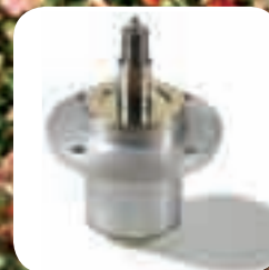
Greaseable aluminum spindles for longer usable life.