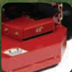
Available in your choice of 44", 52" or 61" cutting widths.