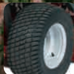
Turf friendly 22 x 10 drive tires (61" & 52").